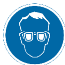
Tightly sealed goggles